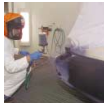
apply color coat