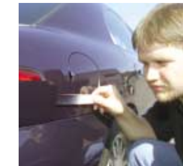
check color match