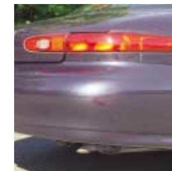
admire flawless finish