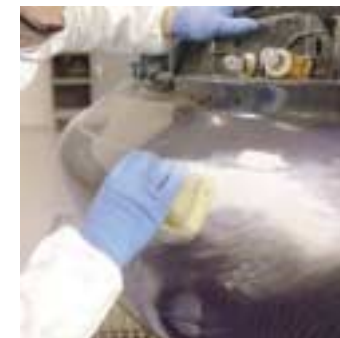
sand repair material