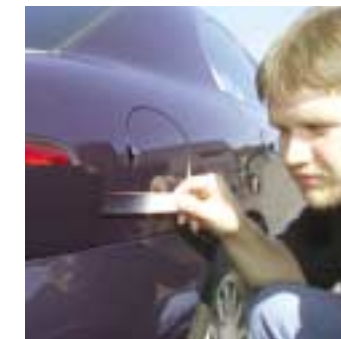
check color match