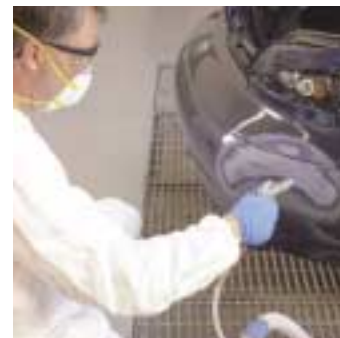
remove sanding dust

DuPont™ and Performance Alliance™ are trademarks of E.I. du Pont de Nemours and Company. Copyright © 2003 E.I. du Pont de Nemours and Company. All rights reserved.