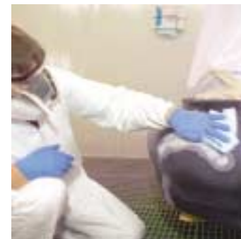
clean repair area