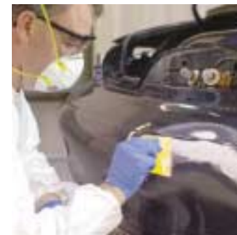
apply repair material