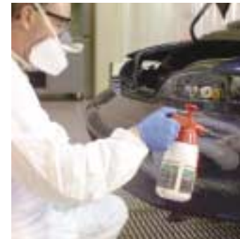
solvent-clean repair area