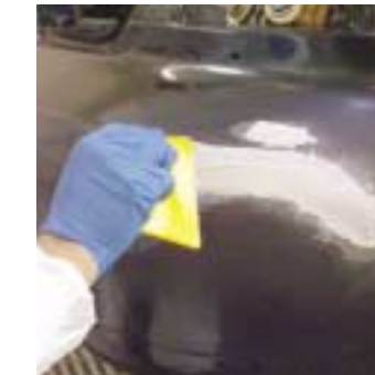
reapply repair material