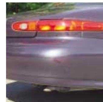
admire flawless finish