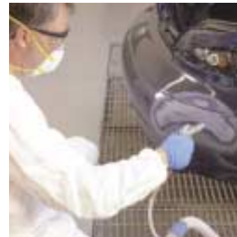
remove sanding dust

DuPont™ and Performance Alliance™ are trademarks of E.I. du Pont de Nemours and Company. Copyright © 2003 E.I. du Pont de Nemours and Company. All rights reserved.