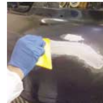
reapply repair material