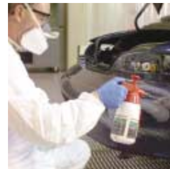
solvent-clean repair area