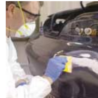
apply repair material